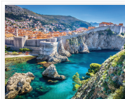
Croatia's Adriatic Sea