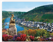
Germany River Cruise