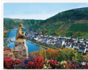
Germany River Cruise